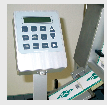
Separate key pad for operating the dispenser on distance. It can be mounted in any position within a distance of up to 5 meters from the dispenser.